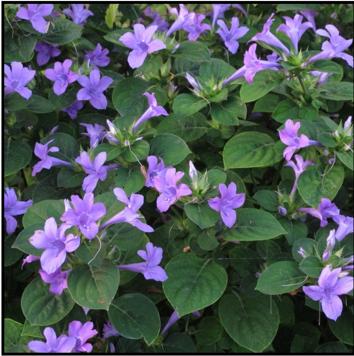
Barleria cristata

Origin: Native to a wide area ranging from Southern China to India