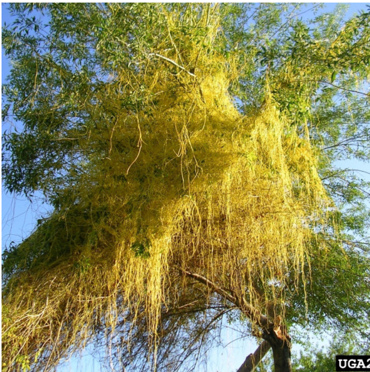
Victor Cordova, City of Houston, Urban Forestry Division, Bugwood.org

Description: Leafless, parasitic vine, 1-3 mm in diameter yellow-gold in color. Thick spaghetti-like stems spreading over large shrubs and small trees. Flowers are small, pale yellow, on short dense spikes.