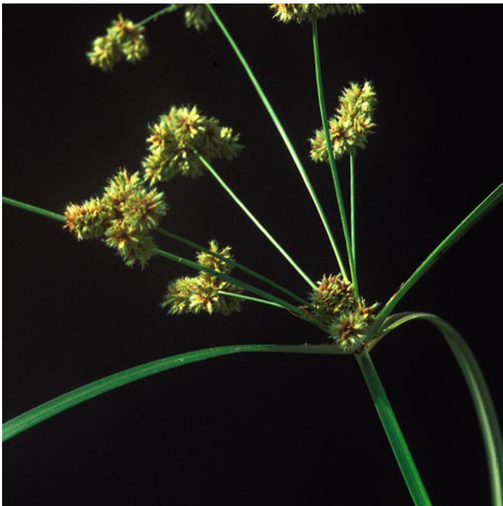
Charles T. Bryson, USDA Agricultural Research Service, Bugwood.org

Description: Large, perennial, rhizomatous, sedge. Culms triangular and glabrous to 3.5 m tall. Leaves broad to 1.5 m tall, margins serrated and sharp. Inflorescence branched with densely clustered spikes (golden brown) surrounded by broad bracts up to 2 m long. Flowers in summer. Achenes dark brown, sessile, biconvex with 2 stigmas.