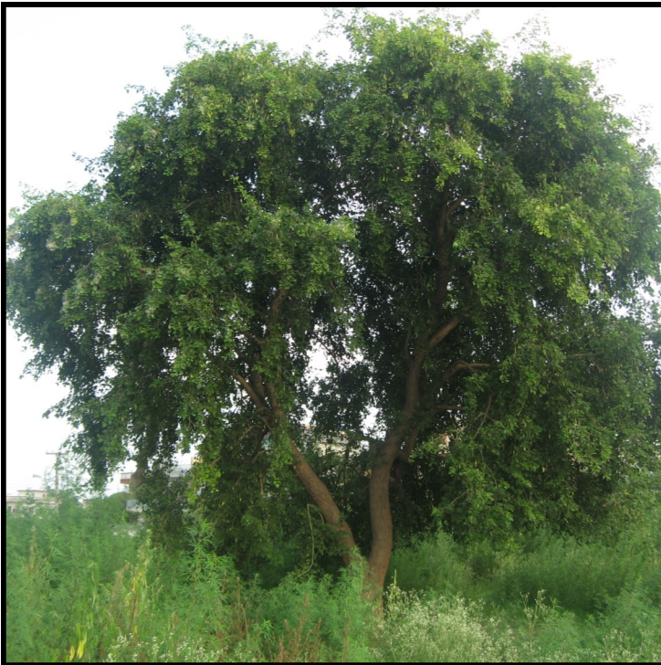
Dalbergia sissoo , by Khalid Mahmood http://en.wikipedia.org/wiki/Dalbergia_sissoo Used under Creative Commons 3.0 license

Description: Medium to large tree, semi-deciduous to 18 m tall with a dense crown and gray bark. Leaves alternate, compound, 3-5 leaflets with a single terminal leaflet. Leaflets glabrous, rounded, to 8 cm long, margins entire, with sharp point. Flowers inconspicuous, pea-like, fragrant, yellowish or white. Fruit a pale brown, flat, papery seed pod, to 8 cm long.