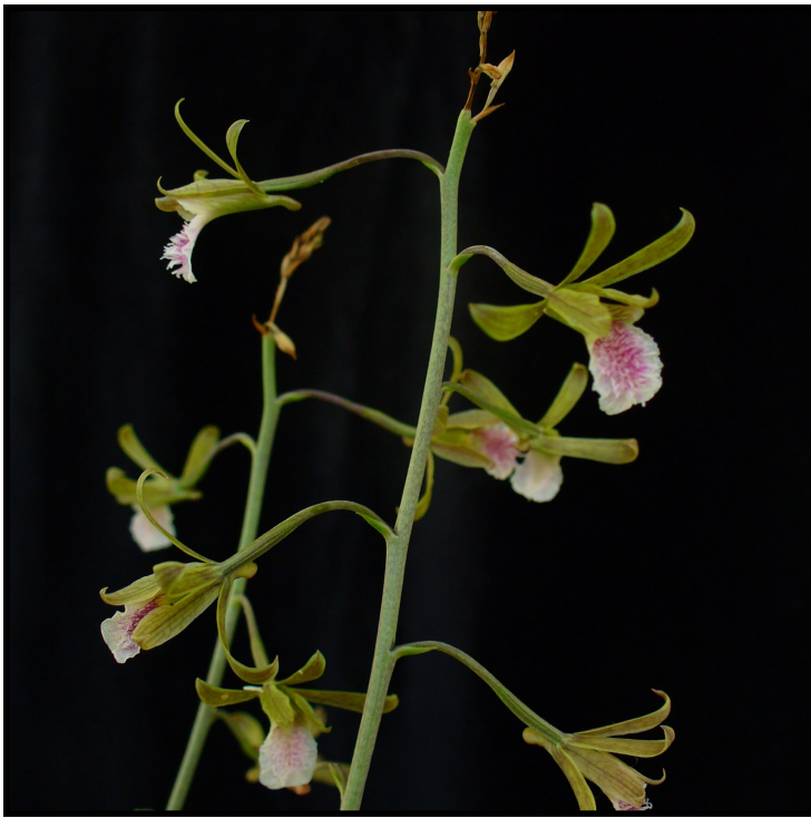
Eulophia graminea flowers, by Scott Zona http://commons.wikimedia.org/wiki/Eulophia_graminea Used under Creative Commons 2.0 license

Description: Herbaceous plant arising from a pseudobulb with short lily-like leaves. Inflorescences arise from spherical to conical pseudobulbs, usually about 5-8 cm in diameter, which typically sit completely or partly above the ground. The slender inflorescences range from 30 cm to 1.5 m tall and bear up to 60 small flowers, each usually about 2.5 cm across with a white lip marked with rose-pink, with green petals and sepals.