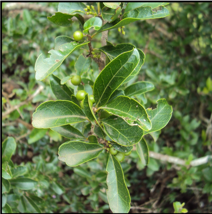
Flacourtia indica 01, by Vinayaraj http://commons.wikimedia.org/wiki/Category:Flacourtia_indica Used under Creative Commons 3.0 license

Description: Evergreen shrub or tree to 10 m tall with sharp spines in the leaf axils and on trunk. Leaves alternate, simple, leathery, to 8 cm long, shape variable, margins toothed to wavy, glabrous or pubescent. Plants dioecious, flowers small and yellowish in small clusters in the leaf axils. Fruit a round edible berry to 2 cm, red to purple when ripe.