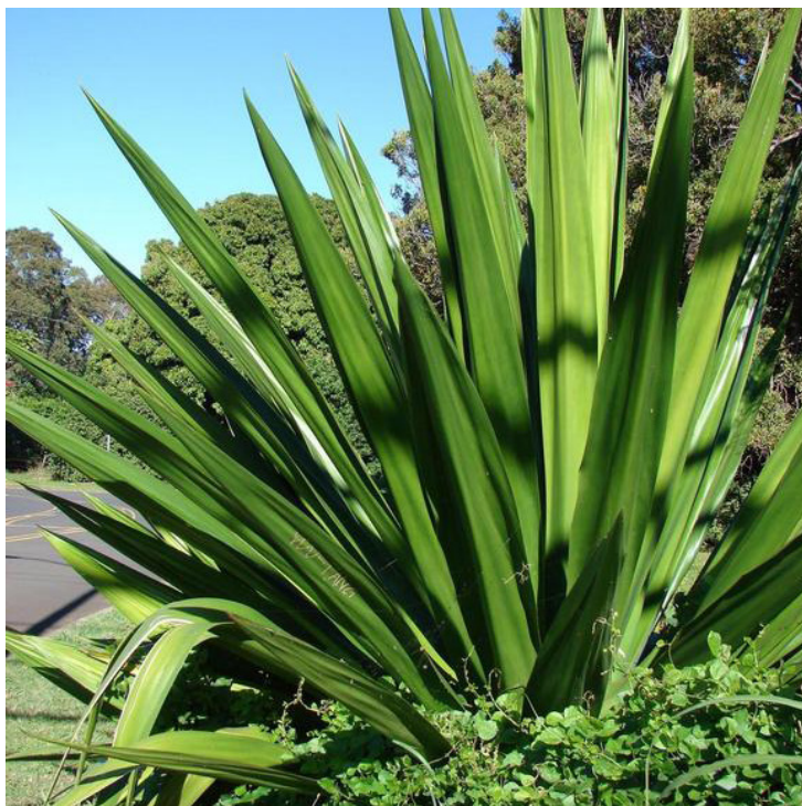
Forest and Kim Starr, Starr Environmental, Bugwood.org

Description: Robust shrub with basal rosette of stiff leaves to 3.5 m in diameter with a woody flowering stalk to 10 m in height. Leaves linear-lanceolate, fleshy, with marginal spines. Flowers on terminal panicles, white, fragrant, 2.5-3.3 cm long.