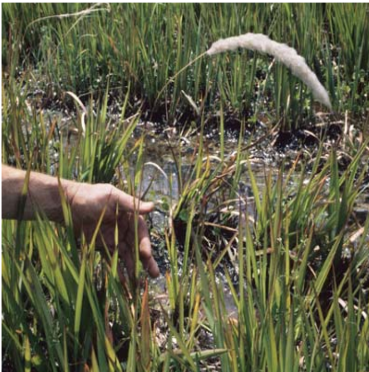
Michelle M. Smith

Description: Perennial grass, growing in loose or compact tufts, from stout, creeping rhizomes with sharp-pointed tips. Leaf sheaths relatively short, glabrous or pubescent; membranous ligule 0.5-1 mm long. Leaf blades erect, flat, narrow and pubescent at base, to 1.2 m tall and to 2 cm wide, with noticeably off-center whitish midvein. Inflorescence a dense terminal panicle, white silky and plume-like, to 21 cm long and 3.5 cm wide. Spikelets paired on unequal stalks, each spikelet surrounded by long white hairs.