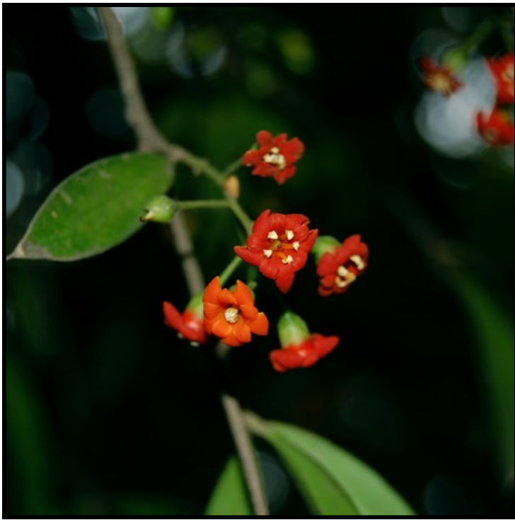
Flowers of Jacquinia macrocarpa

Description: Shrubs or trees to 4 m tall; twigs puberulous-lepidote when young, glabrescent. Stems gray, smooth. Leaves usually alternate, petiole to 6 mm, sparsely puberulent adaxially; blade usually elliptic, sometimes lanceolate or oblanceolate, 3-6 × 1-2 cm. Racemes to 3 cm long. Pedicels ca. 1 mm; bracts lanceolate, 3-7 mm. Flowers with sepals 3-4 mm, margins entire or slightly erose; corolla lobes ovate to suborbiculate, 6-9 mm; stamens shorter than staminodes; staminodes suborbiculate, apex slightly 3-lobed. Berries 3-4 cm in diameter; pericarp wrinkled. Seeds ca. 1 cm. Flowering year-round.