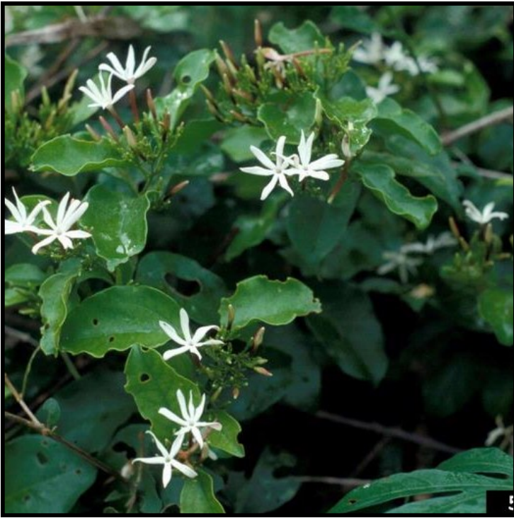
John M. Randall, The Nature Conservancy, Bugwood.org

Description: Scrambling woody shrub or vine, evergreen to 8 m tall. Leaves opposite, simple, oval, glossy, 5-7 cm long. Night-blooming, star-shaped, flowers, white, very fragrant, tubular with 5-9 terminal lobes. Fruit small, round, fleshy black.