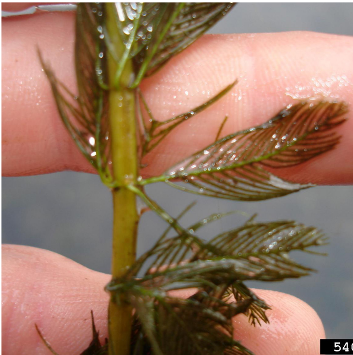
Graves Lovell, Alabama Department of Conservation and Natural Resources, Bugwood.org

Description: Perennial, floating or rooted, submersed aquatic herb with many-branched, slender, reddish stems to 3 m long or longer, often forming dense mats just below the surface of the water. Rhizomatous, rooting at the nodes and reproducing vegetatively by fragmented stems. Submersed leaves gray green, in whorls of 3 or 4, divided into 14-20 pairs of thread-like segments, appearing feathery. Emergent leaves reduced to tiny bracts subtending the inflorescences. Flowers tiny, solitary, in leaf axils of reduced leaf whorls on erect, emergent, spikes to 20 cm tall. Male flowers in upper leaf whorls, female flowers in lower whorls, bisexual flowers often occur in the middle of the spike. Bisexual and male flowers reddish. Fruit a tiny, 4-lobed, rounded capsule to 3 mm across.