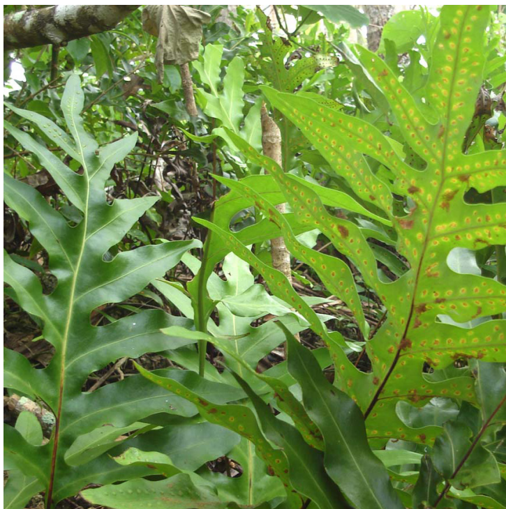
Phymatosorus scolopendria near Tongan beach

Description: Perennial fern with brown-black, scaly, creeping rhizomes, 5 mm diameter. Usually terrestrial but can be epiphytic. Leaf blades broad, flat, entire, obovate to subdeltooid, shiny, dark green, 10-40 cm long and 35 cm wide, usually pinnately divided into one terminal and 1-8 pairs of lateral lobes, wings of the rachis about equal to the width of the lobes. Sori in 2 irregular rows on each side of the midrib, circular or elongate, 3 mm wide, in shallow depressions on the bottom leaf surface, resulting in raised areas on the upper leaf surface.