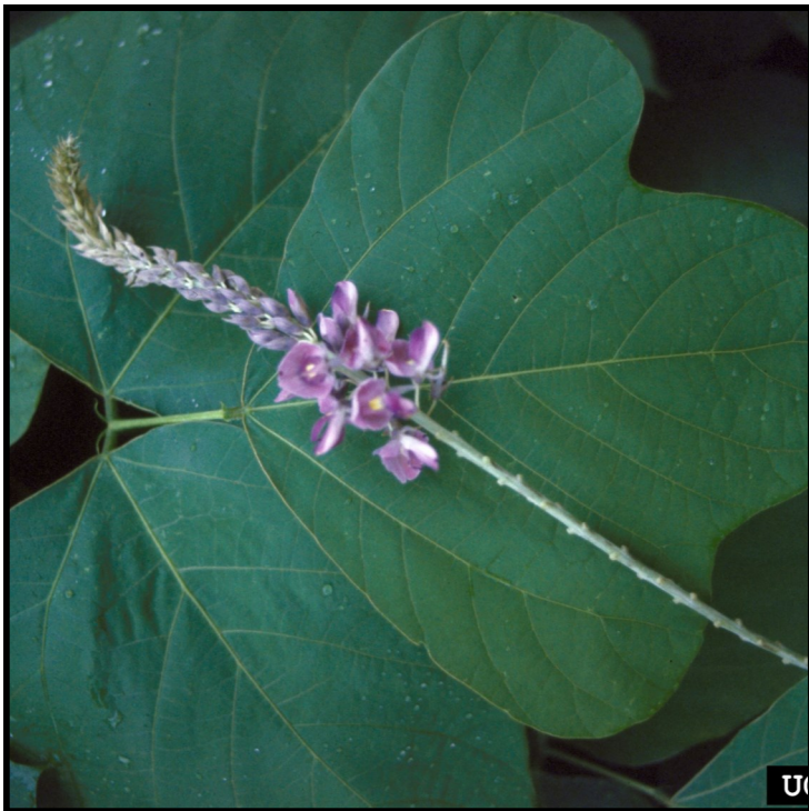
David J. Moorhead, University of Georgia, Bugwood.org

Description: Climbing, semi-woody, perennial vine up to 30 m in length. Stems can reach the diameter of 10 cm or more. Leaves alternately arranged, compound. Leaflets three, broad, up to 10 cm across, entire or deeply 2-3 lobed, margins hairy. Flowers 1.25 cm long, purple, highly fragrant, and borne in long hanging clusters. Flowering occurs in late summer. Seed pod brown, hairy, flattened, with three to ten seeds.