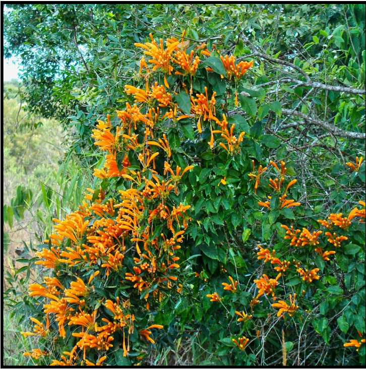
Pyrostegia venusta

Description: Evergreen, rampant woody vine climbing by tendrils. Leaves compound, opposite, leaflets 2 or 3 (terminal leaflet often a 3-parted tendril), up to 8 cm long, ovate, acuminate. Flowers born January to April, in terminal showy dense panicles, bright orange, to 8 cm long, tubular, corolla with 5 reflexed obtuse lobes, stamens 4, exserted.