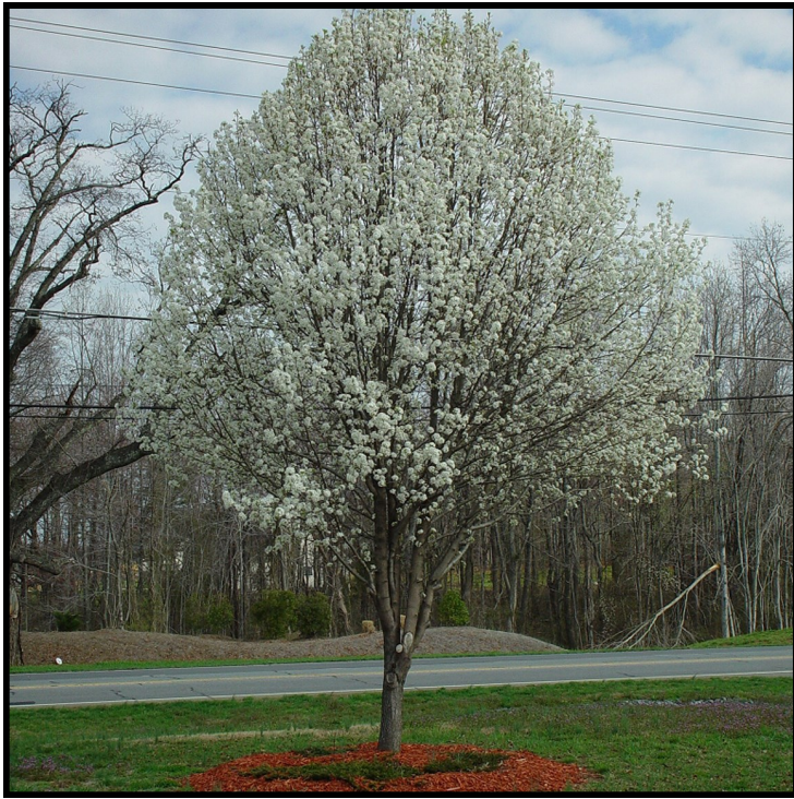
Dan Tenaglia, MissouriPlants.com, Bugwood.org

Description: Tree 9-18 m in height, deciduous, with upright branches, some trees thorny. Leaves alternate, ovate, 5-7.6 cm long, leathery, lustrous green, turning shades of yellow, orange, purple and red in fall. Flowers 2.5 cm across, arranged in clusters of a dozen, each cluster about 8 cm across, appearing before and with the leaves in early spring. Fruit a pome, spherical, brown, about 1.5 cm in diameter.