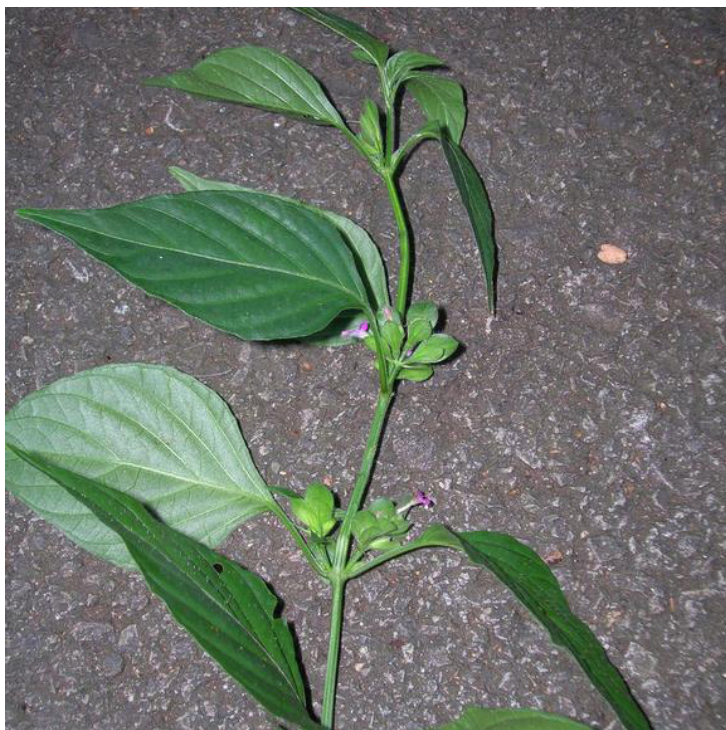
Forest and Kim Starr, Starr Environmental, Bugwood.org

Description: Trailing annual or perennial herb less than 50 cm tall with erect flower shoots. Opposite, ovate, stalked leaves 2-7 cm long. Flowers white or purple, to 1 cm long and arranged in dense spikes that appear squarish because of floral bracts to 1.5 cm long. Fruit an ellipsoid capsule 6-7 mm long with 2 brown circular seeds.