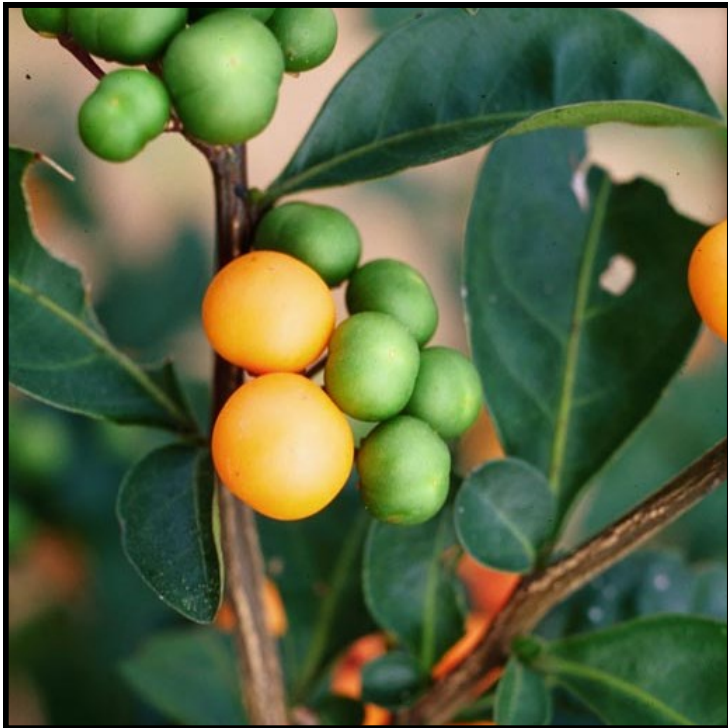
Charles T. Bryson, USDA Agricultural Research Service, Bugwood.org

Description: Shrub upright, up to 2 m tall. Branches smooth, dark maroon brown turning white with age. Leaves paired, larger major leaf widest at the center, 4.7-6.8 cm long and 2.2 cm wide, minor leaf up to 1.5 cm long and 1.4 cm wide. Flowers in upper leaf axils, white turning whitish-lavender, 1 cm wide. Fruit a globose berry, to 1.2 cm in diameter, yellow to orange and fleshy when ripe.