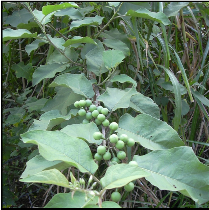
Forest and Kim Starr, Starr Environmental, Bugwood.org

Description: Evergreen, widely branched, prickly shrub or small tree, to 5 m tall. Stems armed with stout, flattened prickles, usually straight or slightly curved. Twigs stellate tomentose. Leaves alternate, simple, petioled; blades oval to elliptic, unlobed to strongly lobed, to 25 cm long, bases unequal, tips pointed, surfaces densely stellate hairy below, less dense above, with usually a few long prickles on midveins (especially above). Flowers many, in large branched clusters, with simple, mostly glandular hairs on stalks. Corolla bright white, to 2.5 cm across, lobed about 1/3 of its length, lobes not recurved. Stamens with prominent anthers. Fruit an erect, subglobose berry, to 1.5 cm wide, yellow when ripe.