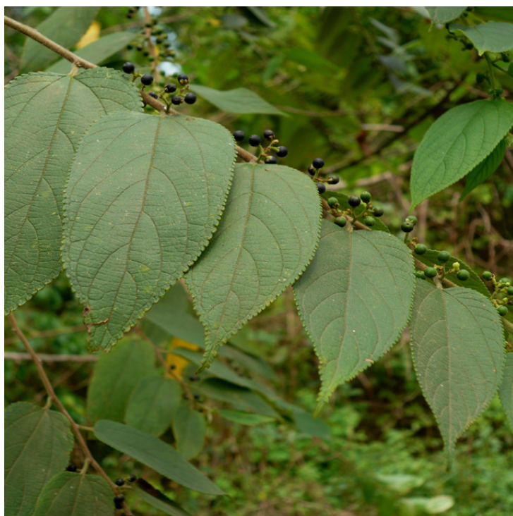
Trema orientalis

Description: Evergreen tree to 18~m tall and 0.6~m in trunk diameter. Bark light gray grown, smooth, finely fissured. Twigs long, slender, unbranched, spreading, light green, turning brown. Leaves alternate, in two rows, with slender leafstalks 1?2~cm long, finely hairy. Blades narrowly ovate, 6?10~cm long and 2?3~cm wide, very long-pointed at apex, base slightly notched with sides unequal, edges finely serrate, thin, with three main veins from base. Upper surface light green, slightly shiny and rough, with veins sunken, lower surface dull and paler, soft hairy, with prominent light yellow veins. Inflorescence an axillary cyme, 1?5~cm long and broad. Flowers many, nearly stalkless, light green, 3~mm long, male and female in separate inflorescences. Fruit a round drupe, 5~mm in diameter, fleshy, pink maturing to black. Seed single, round, brown, more than 1.5~mm long.