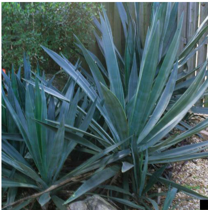
John Ruter, University of Georgia, Bugwood.org

Description: Perennial shrub to 2 m tall with rigid, sword-like leaves extending from basal rosette. Leaves 10 cm wide and up to 1.5 m long with sharp dark brown spine at end, grey-green in color. A branched inflorescence forms atop a flower stalk 7-9 m tall with yellowish-green flowers to 7 cm wide. Fruit an oblong capsule with black seeds. Plants usually sterile and die after blooming once. Small plantlets (bulbils) form in inflorescence that fall to ground after flowering and form new plants.