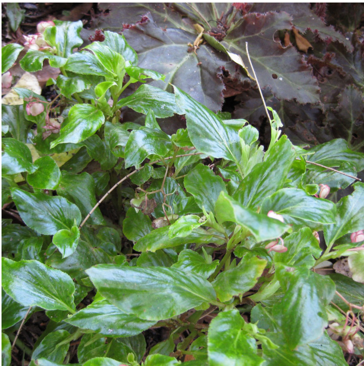
By Raffi Kojian http://commons.wikimedia.org/wiki/Begonia_cucullata Used under Creative Commons 3.0 license

Description: Succulent, glabrous, perennial herb with reddish-green jointed stems to 50 cm tall. Roots from the nodes. Leaves alternate, stalked, simple, waxy to 7 cm long and wide, ovate, margins with minute teeth. Flowers showy to 2 cm, in stalked clusters, tepals variable colors. Fruit a 3-winged capsule with one larger wing to 1 cm.