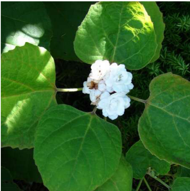
Flowers and leaves at Enchanting Floral Gardens of Kula, Maui, by Forest and Kim Starr Plants of Hawaii - Image licensed under a Creative Commons Attribution 3.0 License.

Description: Shrubs up to 3 m tall, finely pubescent throughout, branches and stems quadrangular. Leaves membranous, broadly ovate to triangular-ovate, 6-25 cm long, 5-25 cm wide, both surfaces sparsely to moderately strigillose, margins coarsely and irregularly dentate, apex acute, and base cordate to truncate. Inflorescences terminal, cymose, densely many-flowered, subsessile or short-pendulate, often subtended by a pair of foliaceous bracts, bracteoles numerous, oblong or elliptic, 1.5-3 cm long, strigillose, especially along the margins. Flowers are fragrant; calyx purple or red, sometimes with white spots, campanulate, 10-15 mm long, 5-lobed, the lobes ancelate, apex acuminate; corolla pale pink, usually doubled by petaloid stamens; stamens and ovary usually modified into extra petals. Fruits are rarely developed.