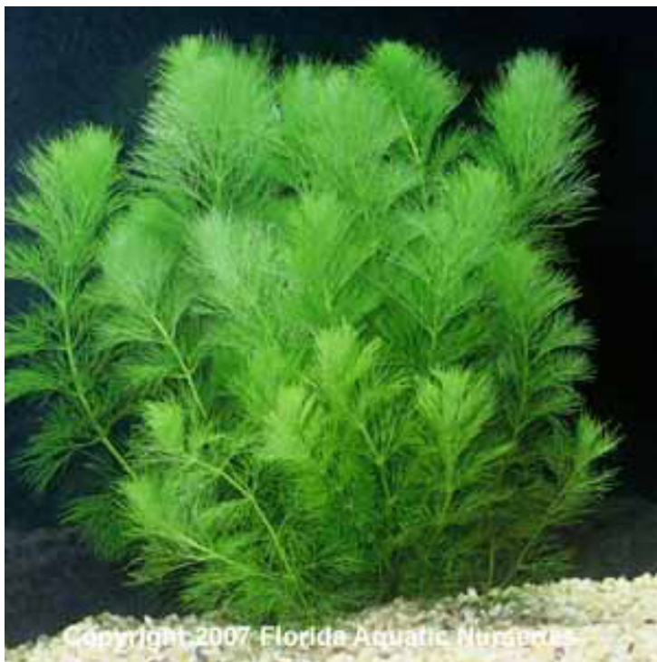
2007. Florida Aquatic Nurseries

Description: Perennial herbaceous aquatic, extremely variable depending on habitat from a terrestrial slender plant to 5 cm tall growing in mud to a highly branched aquatic with much branched stems to 1 m long. Aerial stem simple or branched to 14 cm, submerged stem to 1 m, much branched. Aerial leaves variable but usually whorled and dissected 4-12 mm long. Submersed leaves whorled up to 30 mm long. Flowers axillary from aerial leaves, solitary, stalked, mauve pink, 8-12 mm long