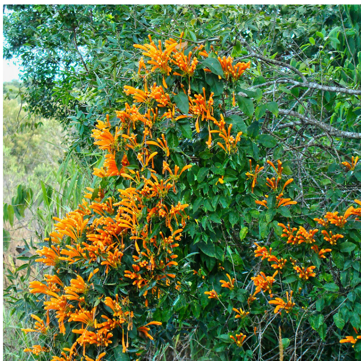
Pyrostegia venusta

Description: Evergreen, rampant woody vine climbing by tendrils. Leaves compound, opposite, leaflets 2 or 3 (terminal leaflet often a 3-parted tendril), up to 8 cm long, ovate, acuminate. Flowers born January to April, in terminal showy dense panicles, bright orange, to 8 cm long, tubular, corolla with 5 reflexed obtuse lobes, stamens 4, exserted.