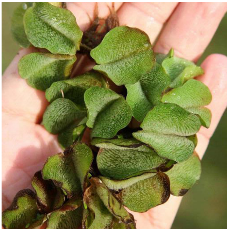
Robert Vid&#233;ki, Doronicum Kft., Bugwood.org

Description: Floating fern, mat forming, with rootless stems to 10 cm long. Leaves born in 3s, appear distichous (third leaf resembling roots), rounded to broadly elliptic, to 1.5 to 3 cm long and wide, often folded along the midrib, base cordate, hairy on both surfaces, papilla on upper surface with 4 distal hairs joined at the tips (resembling a basket).