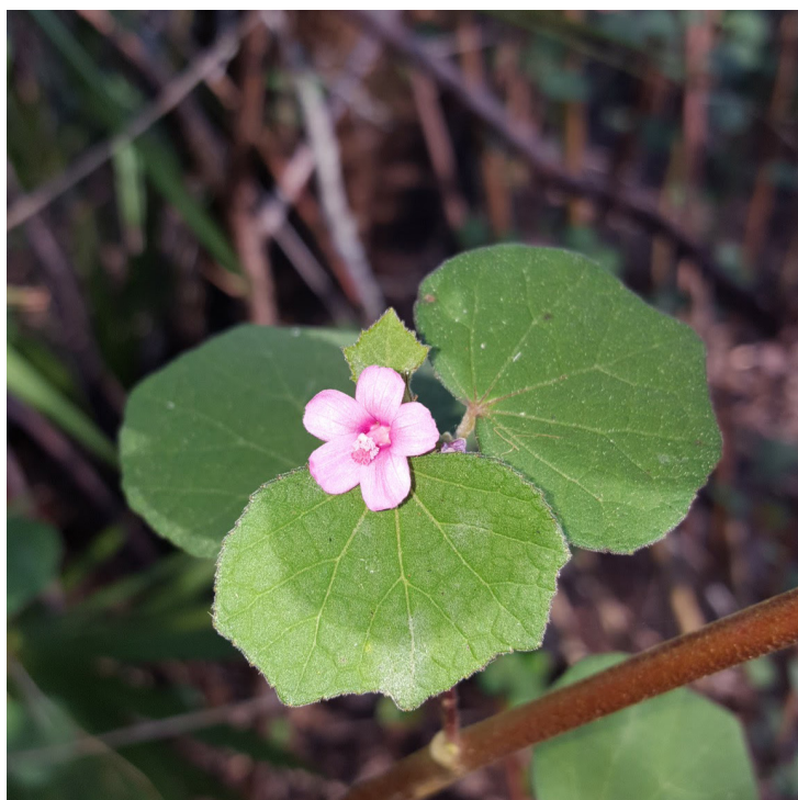
Michelle M. Smith

Description: Large annual growing to about 3~m high. Leaves are 4 to 8~cm long, with shallow palmate lobes, and pubescent. The flowers are pink, grow in clusters, and have a tube of united stamens. Fruits are covered in hooked bristles and break into five segments at maturity, easily attaching to animals and clothing.