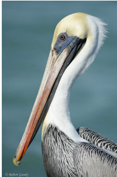
Adult.