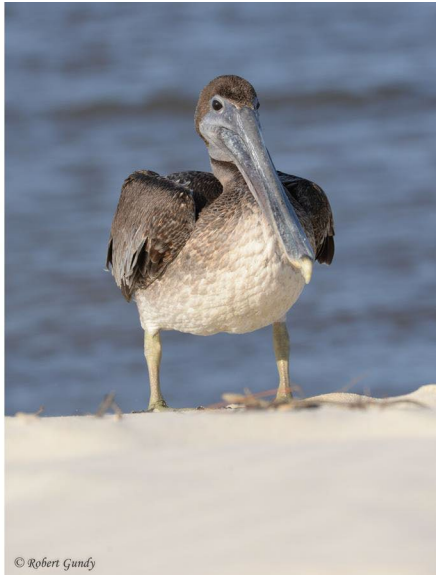
Immature.