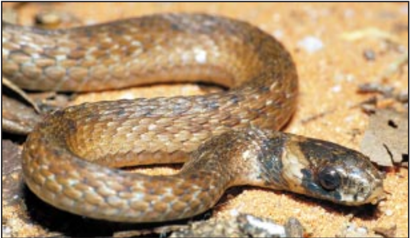
brown snake from peninsular Florida

State-protected status applies only to brown snakes in the Lower Florida Keys.